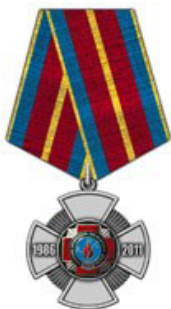
In memory of accident on the Chernobyl NPP