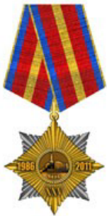
For 20 years after building of "Shelter"

From 14 th April 2010 Soyuz-Chernobyl have their own awards for merits in liquidation of consequences of radiating, technological and ecological failures and accidents, rendering assistance by the victim in such failures and accidents, and also for the considerable contribution to the activity of Soyuz-Chernobyl: