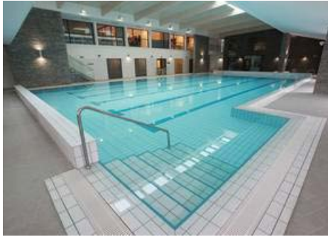
Pictures 1 and 2: Slovenian Red Cross Youth and Health Resort Debeli Rtič

The Youth and Health Resort Debeli Rtič is also closely connected with help that Slovenia provides for Ukrainian children who were affected by the Chernobyl accident. In 2010 the Slovenian Red Cross with cooperation and financial support of the Ministry of Foreign Affairs for the sixth time carried out the project “Rehabilitation of the Chernobyl children”.