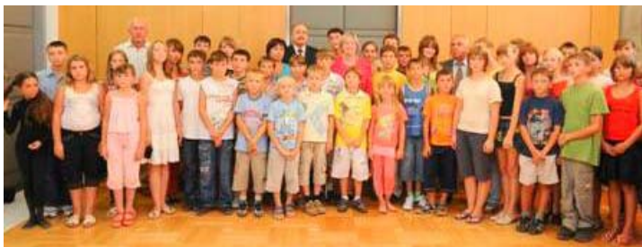
Pictures 11 and 12: Within the framework of the project “Rehabilitation of the Chernobyl Children” children visited the Ministry of Foreign Affairs in Ljubljana