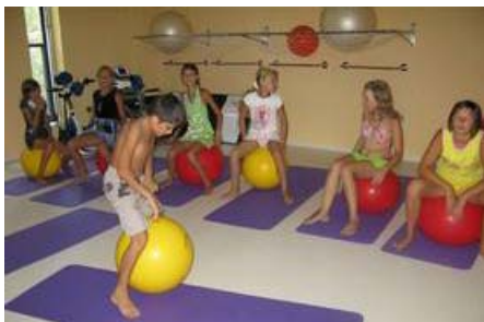
Pictures 4, 5 and 6: Children participating in different activities while spending time in Debeli Rtič

However, the children also took part in different activities, such as sport (swimming, volleyball, basketball, football, kayak ...), art, evening shows, creative workshops and presentations of Ukrainian culture to other children in the resort. During the time of their stay in Debeli Rtič children from Ukraine also went on an excursion to the maritime province of Slovenia, where they visited salt-works, the shell-graveyard, the Postojna caves and the Predjama castle. They also took a trip with a boat to Piran and an excursion to Ljubljana. While they were in Ljubljana they also visited the Ministry of Foreign Affairs where they were greeted by the State Secretary and where children presented their dancing and singing program, which reflected Ukrainian culture.