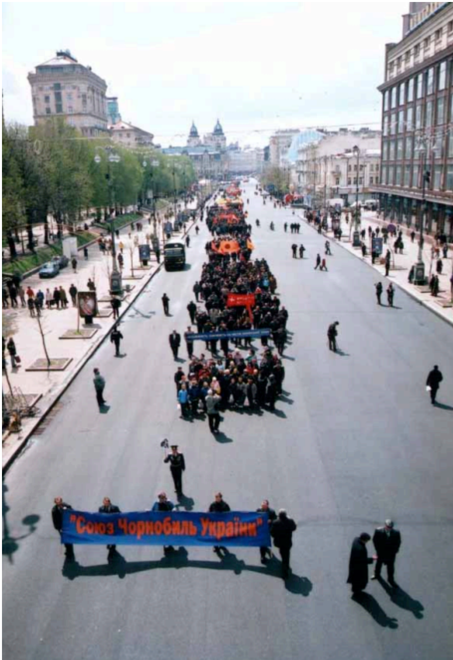
One of the demonstrations organized by "Chernobyl Union of Ukraine"